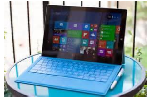
Microsoft Surface Pro 3 https://www.microsoft.com/surface/en-us/products/surface-pro-3